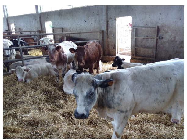
Crossbreed beef cattle reared on a SusCatt farm.

Animal feeding is one of the main concerns and the sector is searching for innovative strategies to maintain profitability from environmentally sound and ethical systems. We in-