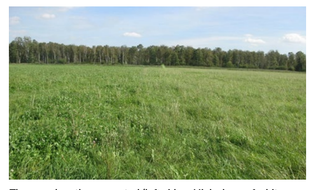
The sward on the renovated (left side – High share of white and red clover) and not renovated meadows (on the right side).

(mostly red and white clover) from 3% to 22-25%. The figure below shows the recorded performance for the different pasture types over summer and winter.