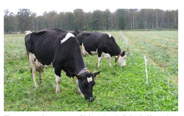
The cows on the pasture at Biebrza farm in Poland .

Renovation of pastures and meadows reduced weeds in the sward from 28% to only 6-7% with the proportion of productive grasses increasing from 60% to 69-71% and legumes