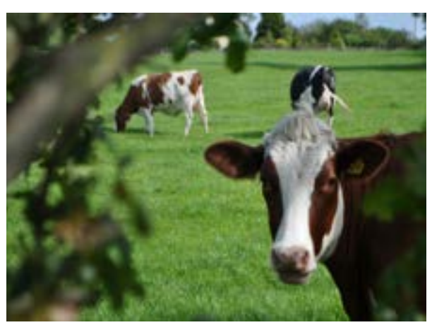
Typical crossbred cows.

Seventeen herds were involved (7 organic and 10 low-input-conventional); all a mix of both purebred and crossbred cows, with the pedigree of each cow described by the farmers. Production, fertility and health records from