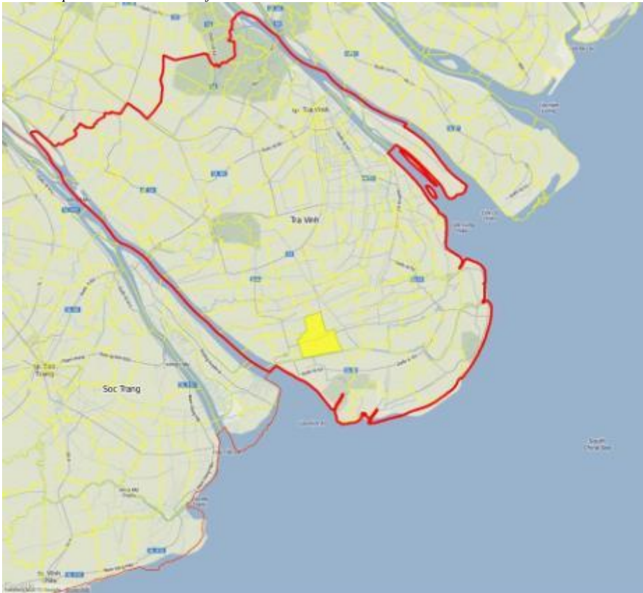
Location of project commune of Đôn Xuân in Tra Vinh province.