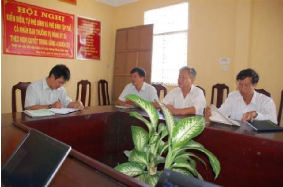
Commune Mayor in Đôn Xuân (to the left) and his two assistants and to the right, vice chancellor in Tra Vinh province.