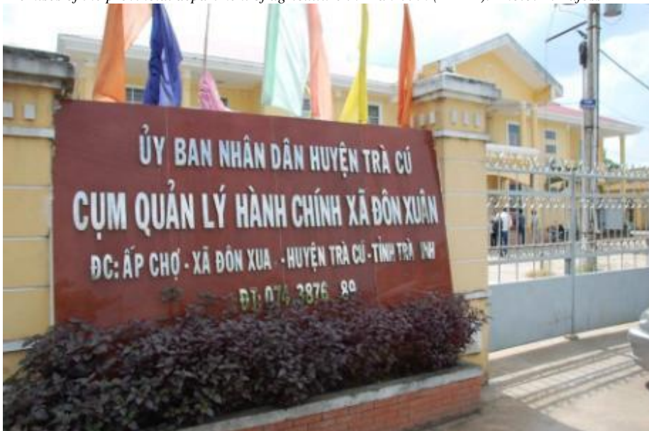
Headquarter of Đôn Xuân commune in the Tra Vinh province.