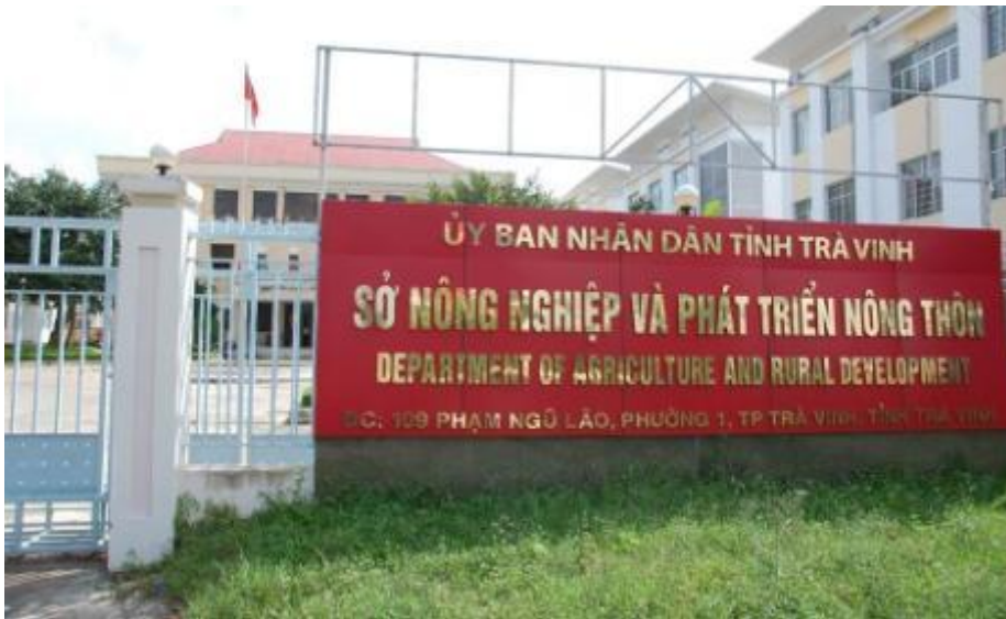
Premises of the provincial department of agriculture in Tra Vinh (DARD).