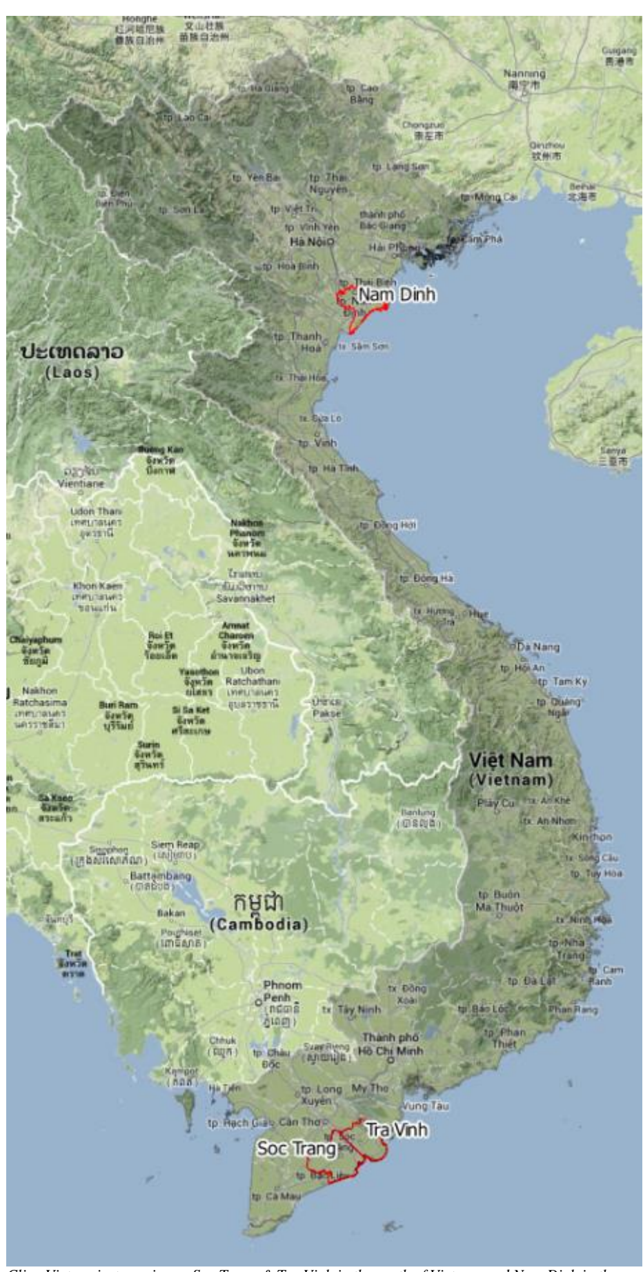
ClimaViet project provinces: Soc Trang & Tra Vinh in the south of Vietnam and Nam Dinh in the north.